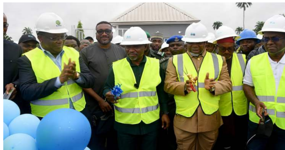
Commissioning of NEDOGAS 300MMscfd capacity Gas Gathering (KGG) and Injection facility, Kwale, Delta State.