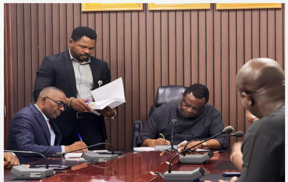
NCDMB signed a construction contract for Oloiribi Museum and Research Centre.