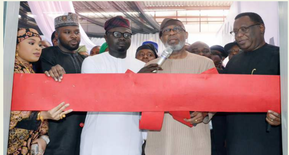
Commissioning of Amal Technology Gas Leak Detection and Printed Circuit Board Manufacturing Facility Abuja.

Technical Bid Evaluation, Commercial Evaluation and Recommendation for Award to a record-breaking short duration, such as the approval of the Nigerian Content Compliance for the NLNG Train-7 commercial evaluation within 48 hours. This initiative was the first between a regulator and its key stakeholders in the oil and gas industry. Review of the signed SLAs have shown consistent turn-around within the timelines stipulated by the parties to the agreements.