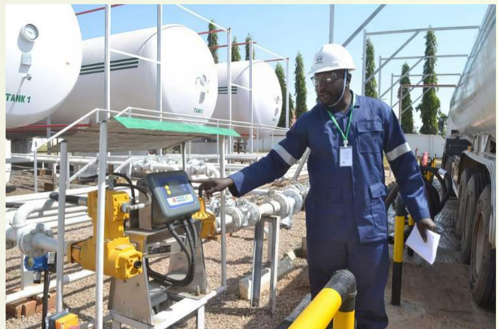
Commissioning of one of Butane Energy LPG plants.