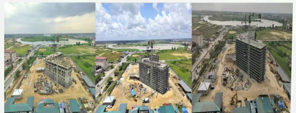
Aerial pictures showing progress of construction work on site of NCDMB Conference Hotel from January to December 2024

g) NCDMB is expanding and relying more on the use of digital tools and analytics, integrating cutting-edge technologies, and supporting research and development. In this era of the Fifth Industrial Revolution, the Board is making sure to stay ahead of the curve by prioritising the development of digital skills to remain competitive and future-ready.