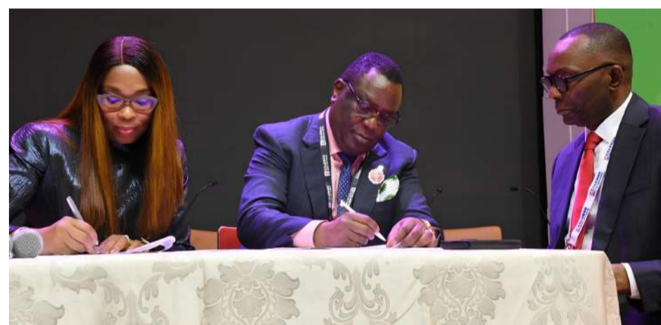
NCDMB signed an MoU with the Bank of Industry to enhance access to facilities for local service companies in the oil and gas sector.