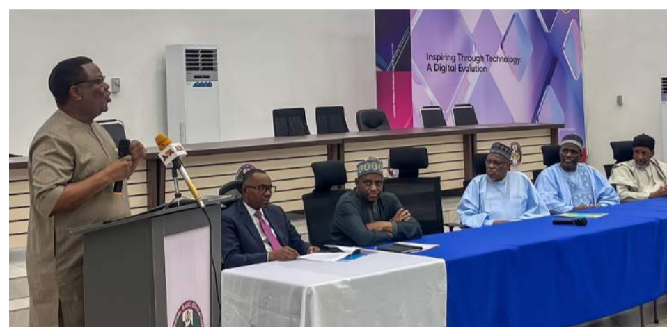
NCDMB signed an MOU with UBEC for smart schools development initiative.