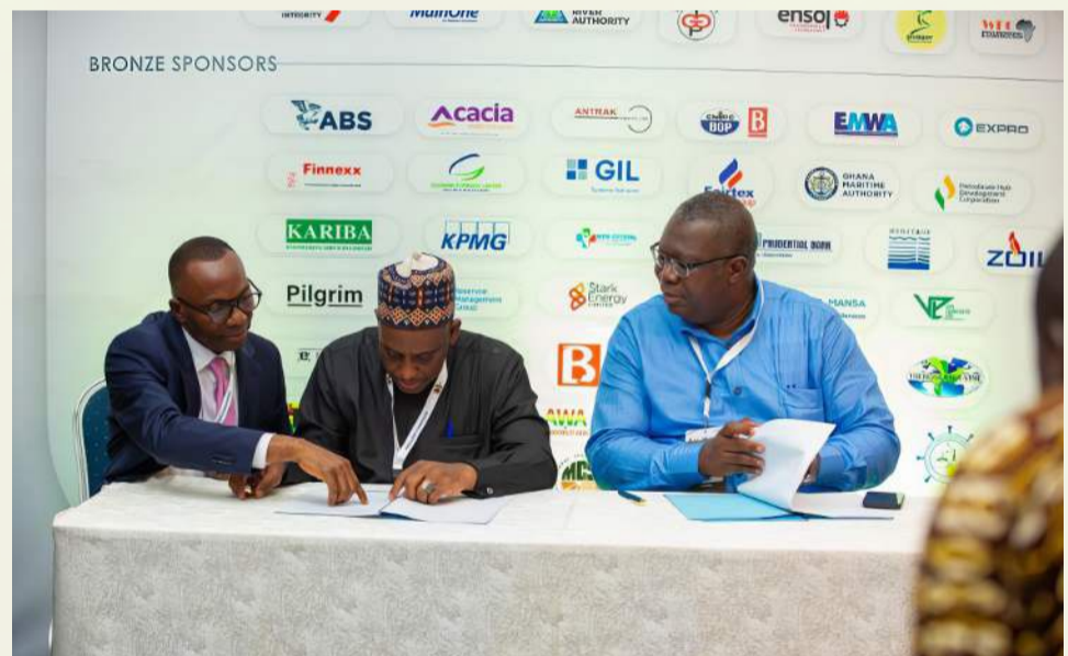
Driving local content adoption in Africa: NCDMB signed an MoU with the Petroleum Commission Ghana.