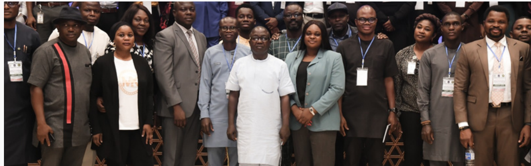
A cross section of attendees on day two of the recently held NCDMB staff sensitization workshop tagged Achieving Zero Tolerance for corruption in the workplace.